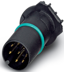
Sensor/actuator flush-type plug, 8-pos., with straight THR solder connection, only contact insert

Please be informed that the data shown in this PDF Document is generated from our Online Catalog. Please find the complete data in the user's documentation. Our General Terms of Use for Downloads are valid ( http://phoenixcontact.com/download )