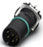
Sensor/actuator flush-type plug, 8-pos., shielded, with straight THR solder connection

Sample set - SACC-CIM12MS8PL180THRSHSAMPLE - 1413553